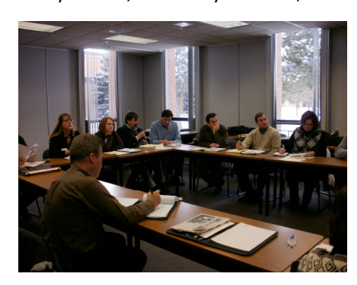
Who We Are: Community-Driven, University-Assisted, Partnership